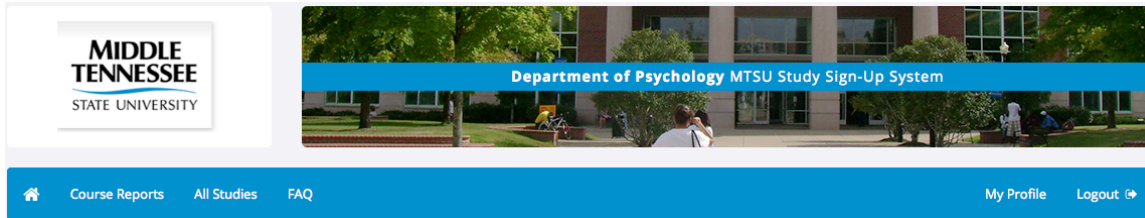
Figure 2: Task bar.

Use the task bar to choose the activity that you want. When you are finished, always choose Logout to prevent others from viewing your records.